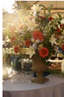
Guests were in range of ho