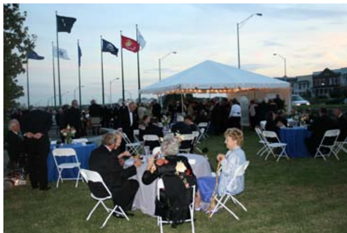
Guests take advantage of the beautiful evening on the lawn.