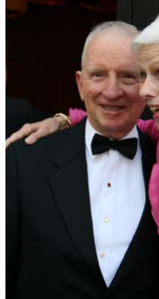
Mr. Ross Perot and M