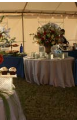
Invited to enjoy a hors d'oeuvres.